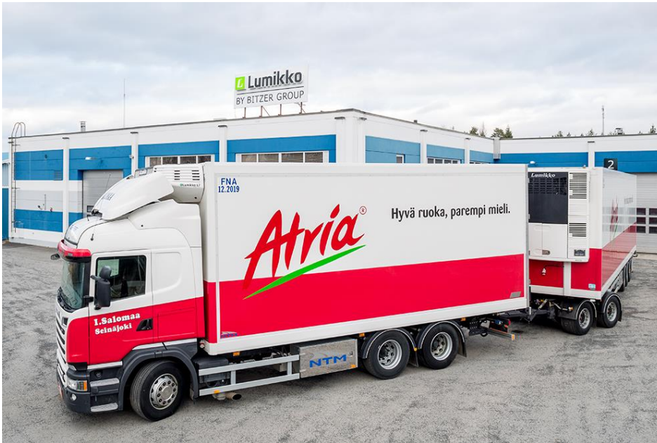
Image 2: Lumikko and CareUnit concluded an exclusive sales and service contract in 2014.

Image 1: The new Lumikko system weighs in at just 400 kilograms and is therefore much lighter than any comparable systems.